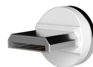
MT03-0304-036014 AUTOMATE | Magnetic Connector Micro B