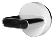
MT03-0304-036022 AUTOMATE | Magnetic Connector USB C