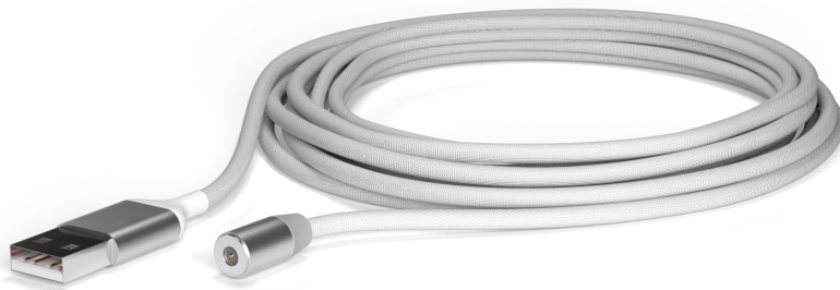
MT03-0304-069015 AUTOMATE | Magnetic Extension Cable 3M

Magnetic connector self-locates making it easy to snap into place.