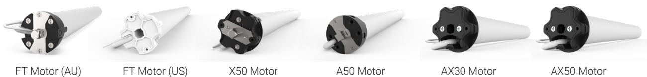
FT Motor (AU)